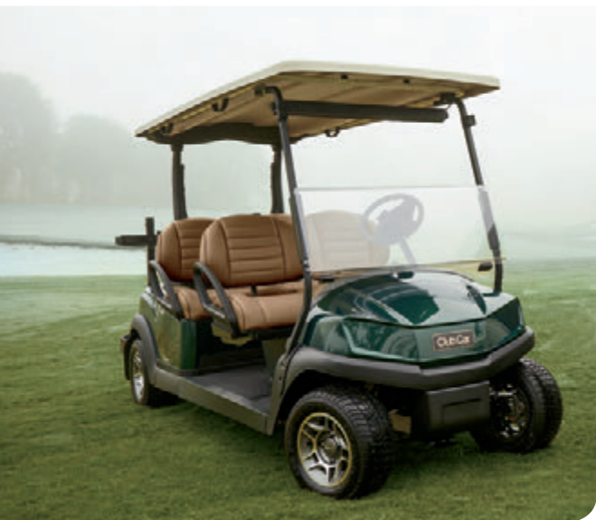
Tempo 4Fun – Built for 4 passengers

The award-winning Tempo continues to exceed industry expectations, delivering a smooth, comfortable ride and connected touchscreen technology no other golf car can match. With a distinctive design and golfer-first features, it's available in 2- or 4-passenger models, with a standard electric engine or an energy-saving Lithium Ion battery—and can be endlessly customized to suit your course's needs.