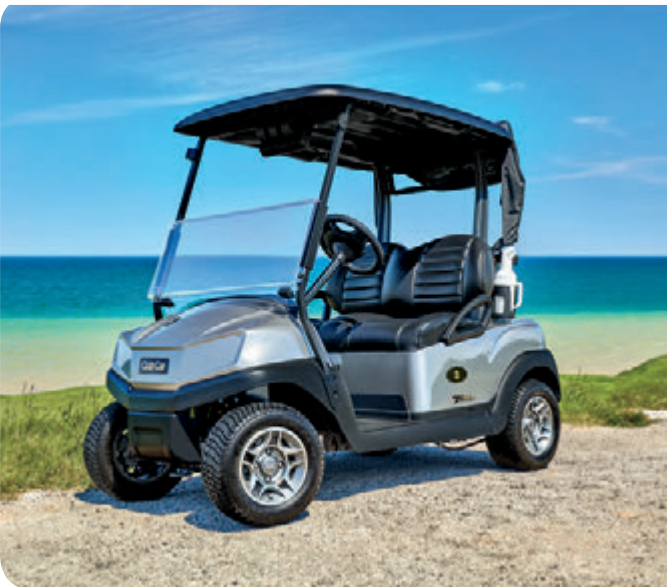
Tempo Li-Ion – Built for efficiency

High-performing and packed with the latest technology, our Lithium Ion golf cars save time, increase car reliability, and conserve energy to improve the overall performance of operations. When it's time to power up, the fast charging times and ability to hold a charge across multiple rounds keep Lithium Ion-powered cars on the course and out of the barn.