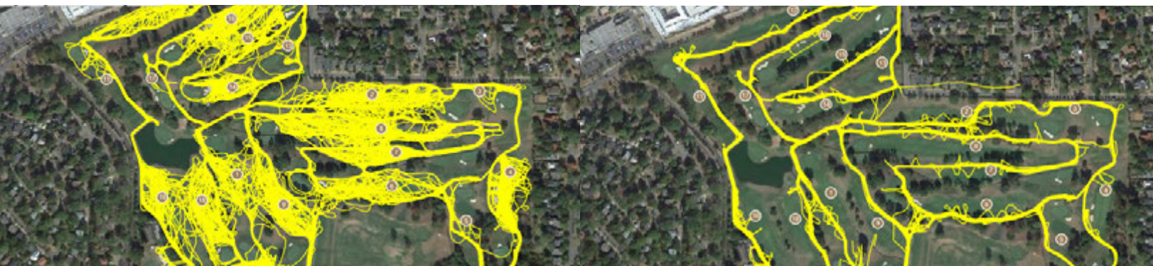
Heat map of a course before Car Control's cart path implemented.

Maximize course efficiencies and fleet performance with the Visage Fleet Management system. Offered exclusively by Club Car and installed at over 1,000 courses worldwide, Visage is a tested technology system designed to strengthen your bottom line. Use it to increase revenue, efficiently manage resources, and accent a golfer's experience.